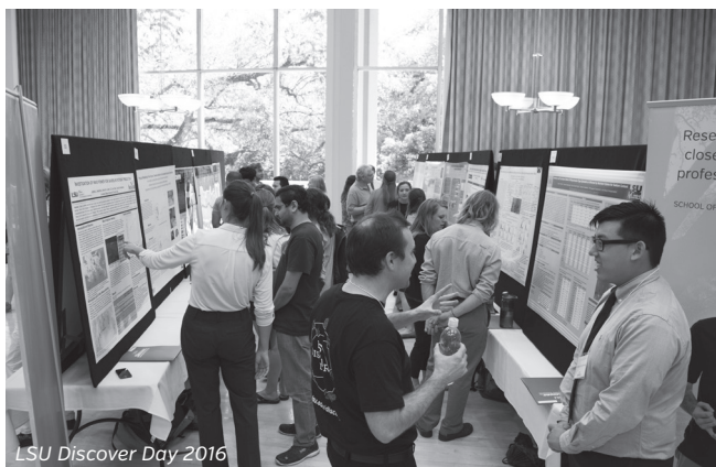
LSU Discover Day 2016