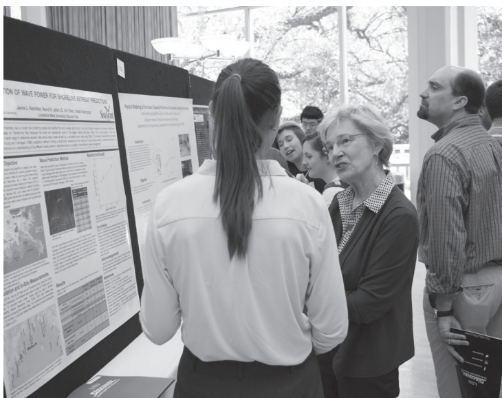
LSU Discover Day 2016